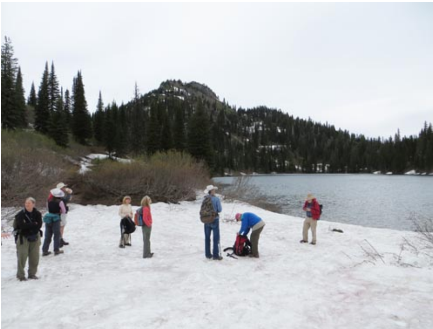
Why is no one laying down on the beach?