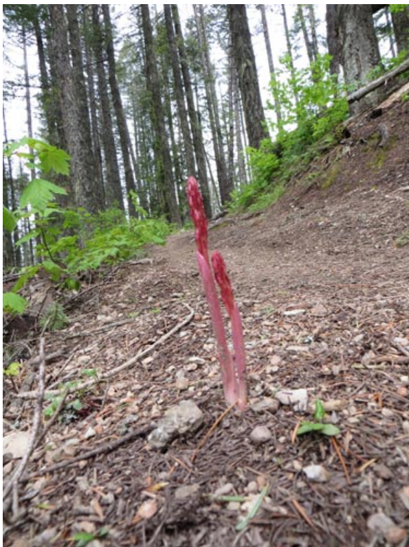
Something sprouting; likely striped coral root!