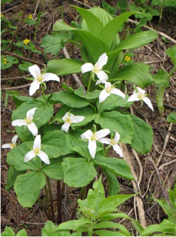
A clump of trillium aside false hellebore.