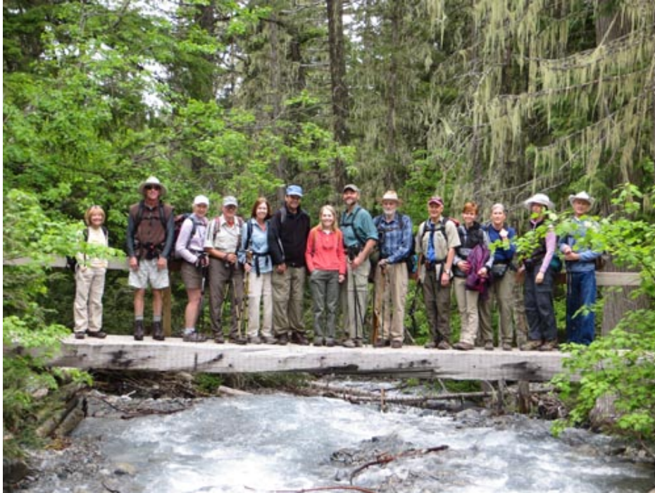
Rangers test the load limit on the bridge over Krause Creek!