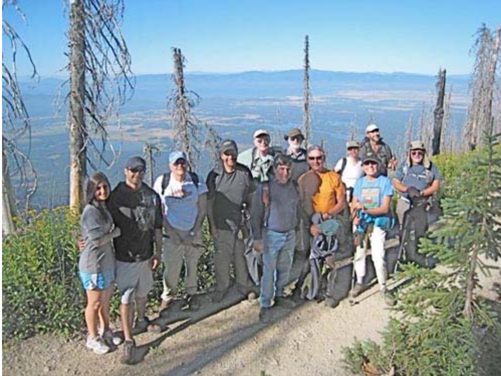
Another clear day with nice views of Flathead Lake and Valley!