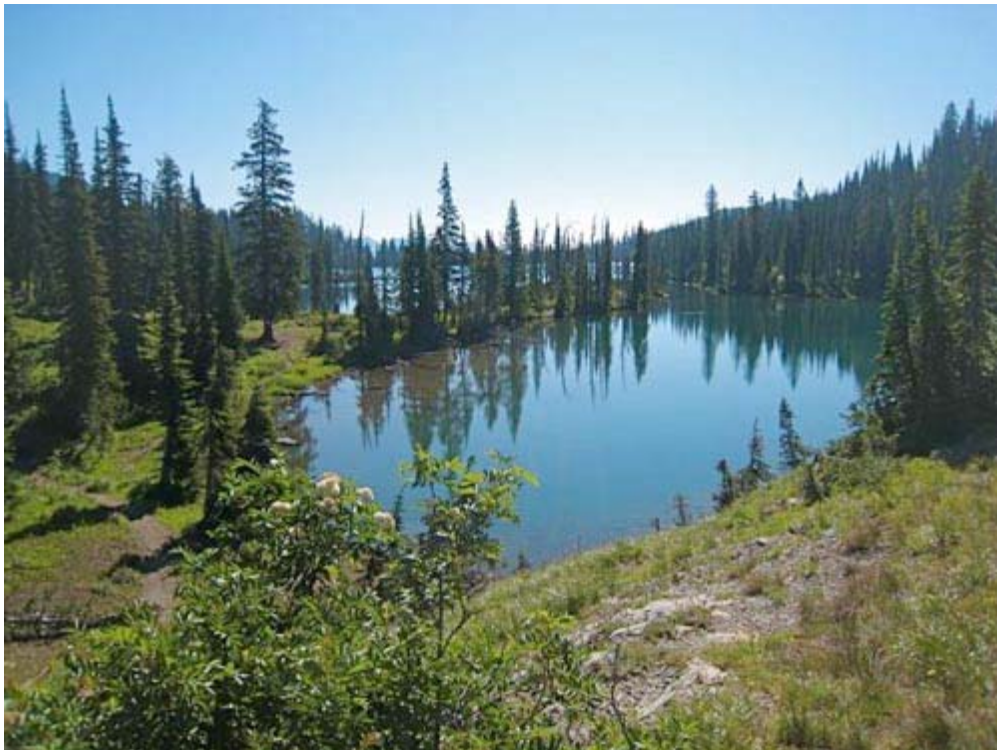
Birch Lake under blue skies.