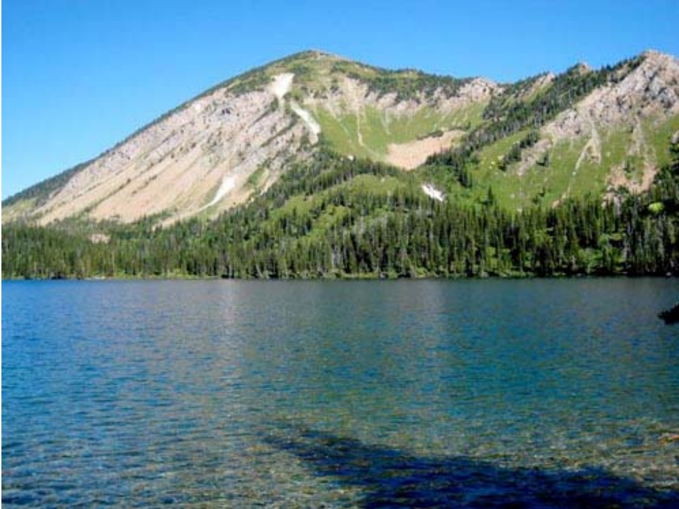
Birch Lake and Mount Aeneas.