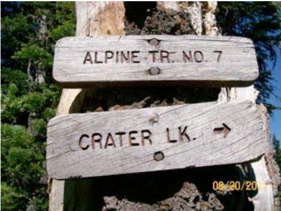
Let's continue that-a-way!