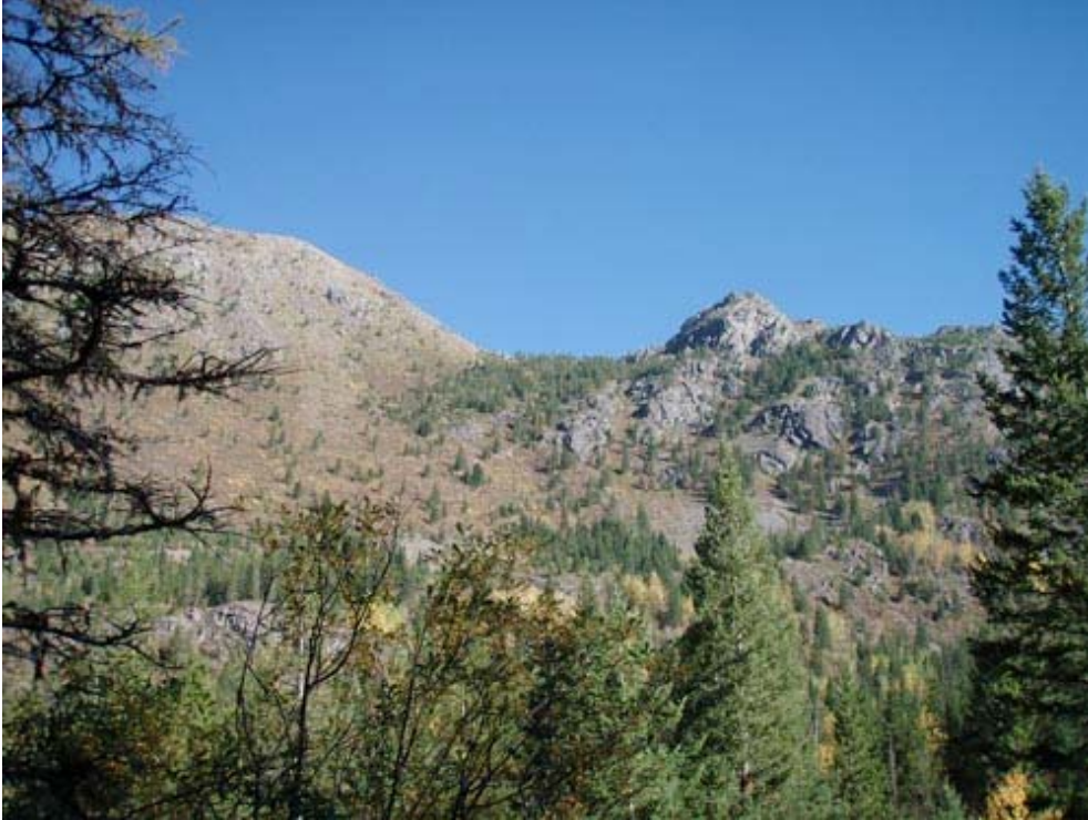
. . . with views across Wolf Creek toward Crater Lake.