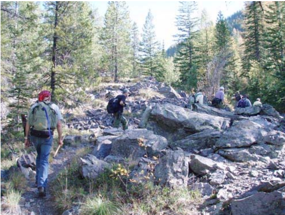
Broken Leg Trail gets rocky above Elk Spring . . .