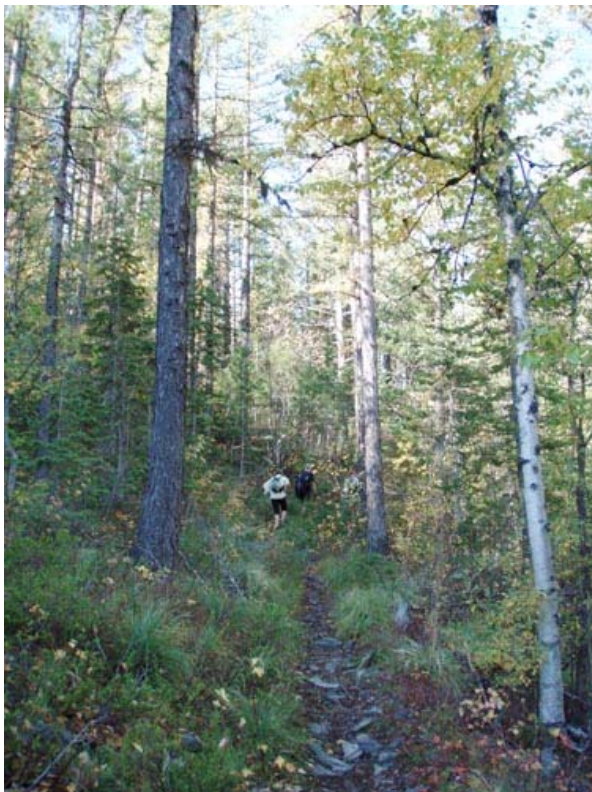
Fall along the Broken Leg Trail . . .