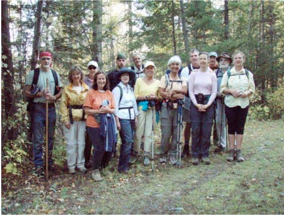
A pause along the old Bear Creek Road.