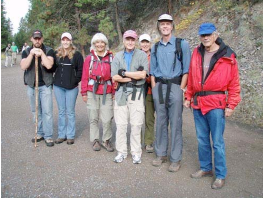
The Rangers were just a few of the many folks out enjoying the Swan River Nature Trail!