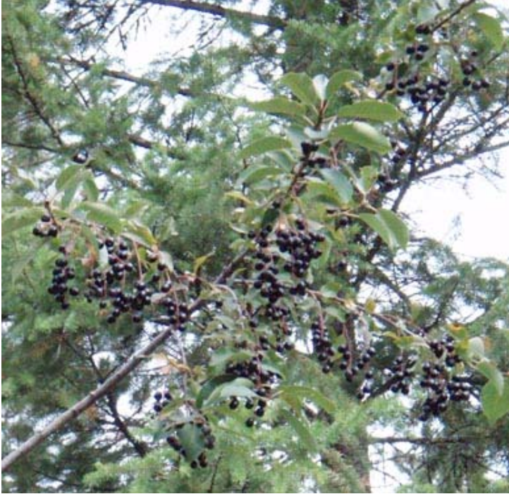
Chokecherries along the way are ripe and dark!