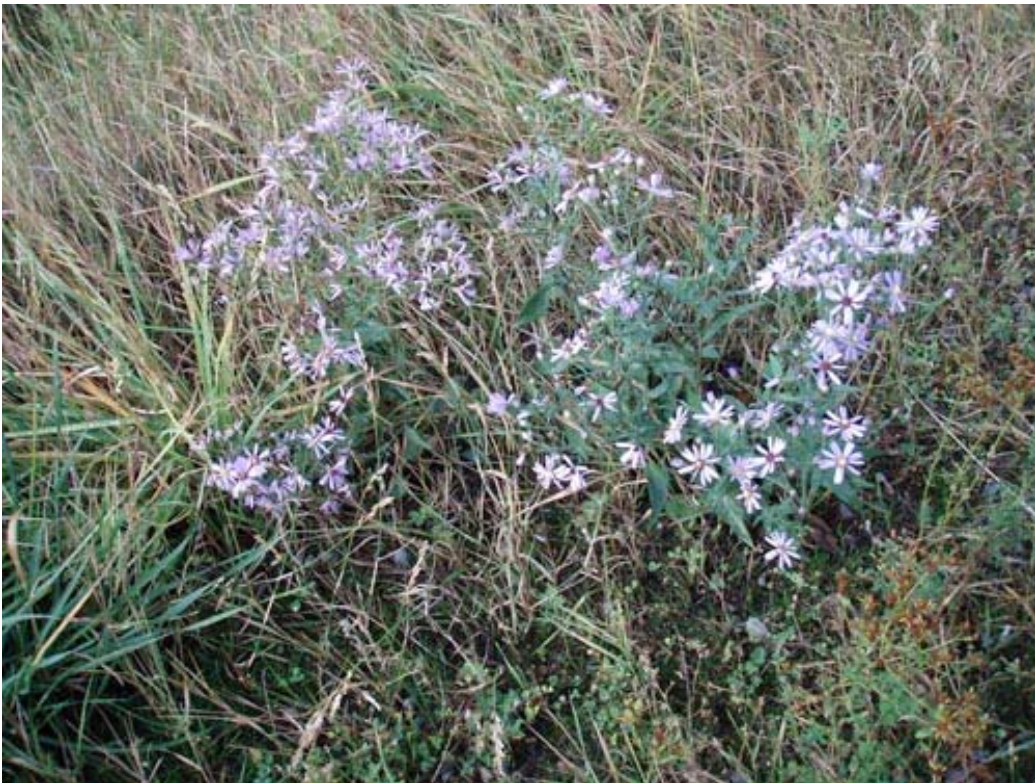
Showy aster, on the other hand, is still in flower!