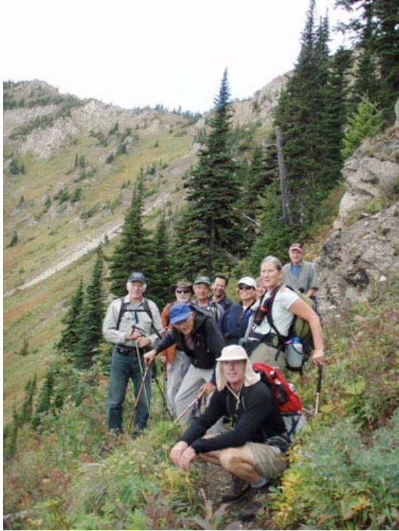
Headed for the Swan Crest from Peters Ridge.