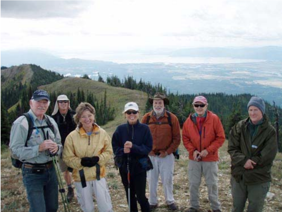
Atop Hash Mountain with Flathead Lake in the background.