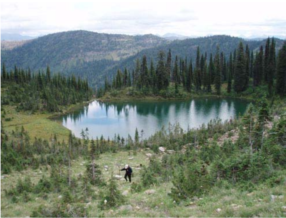
Lamoose Lake from Alpine Trail #7.