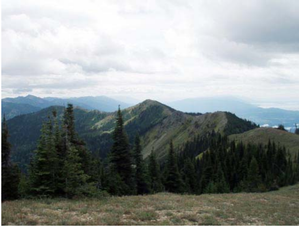
A nice bow in the Swan Crest south of Hash Mountain.