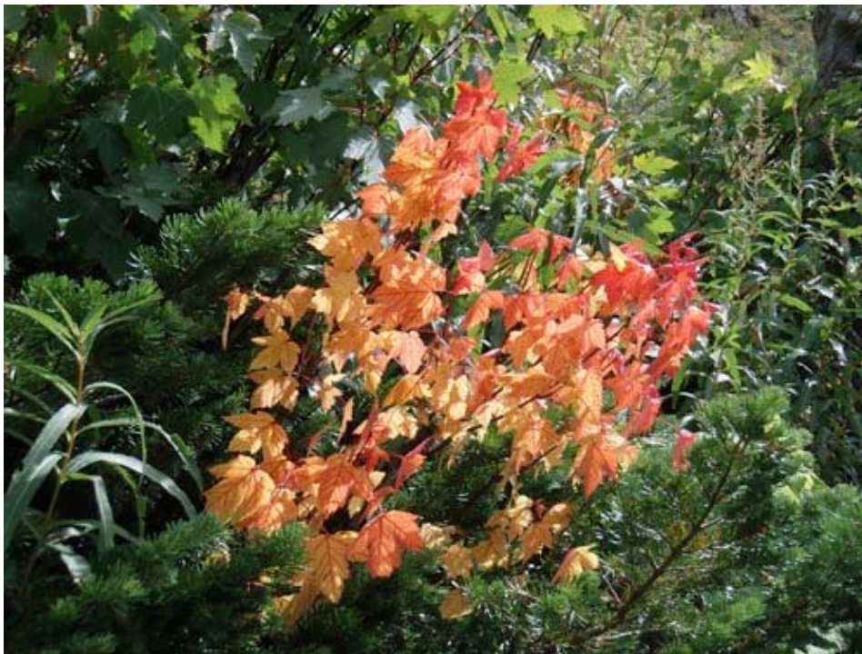
Sun highlights mountain maple turned red for fall!