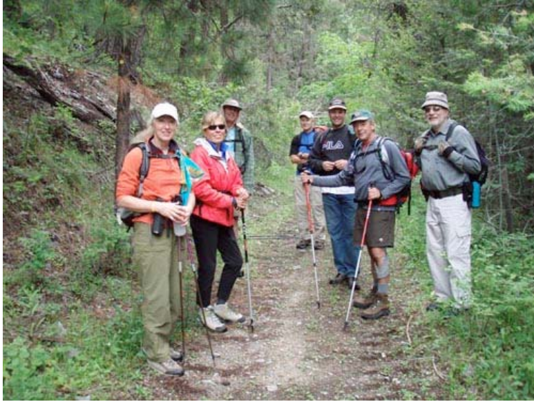
Swan Rangers pose next to one of several "bear rub trees" along the road and trail.