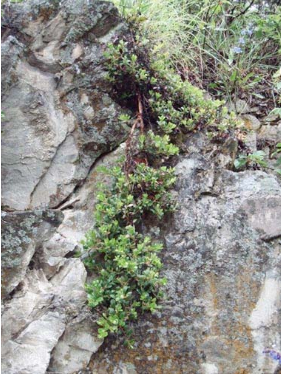
Twin-flower cascading over rock.