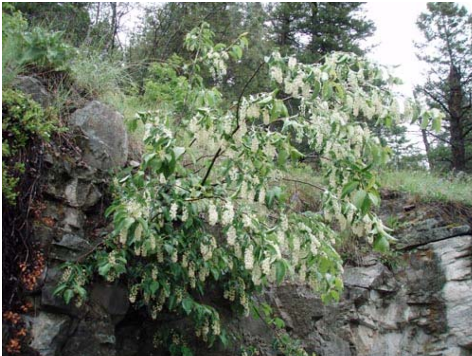
Chokecherry in bloom.