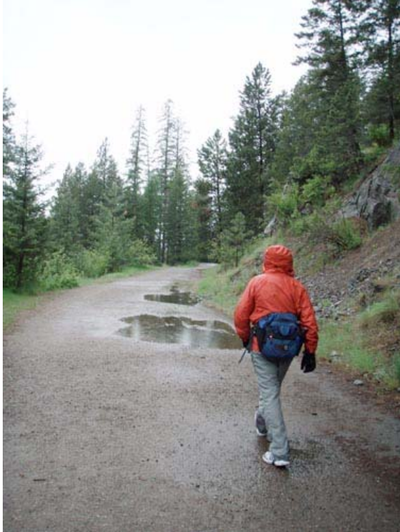
Puddle-dodging on the Swan River Trail.