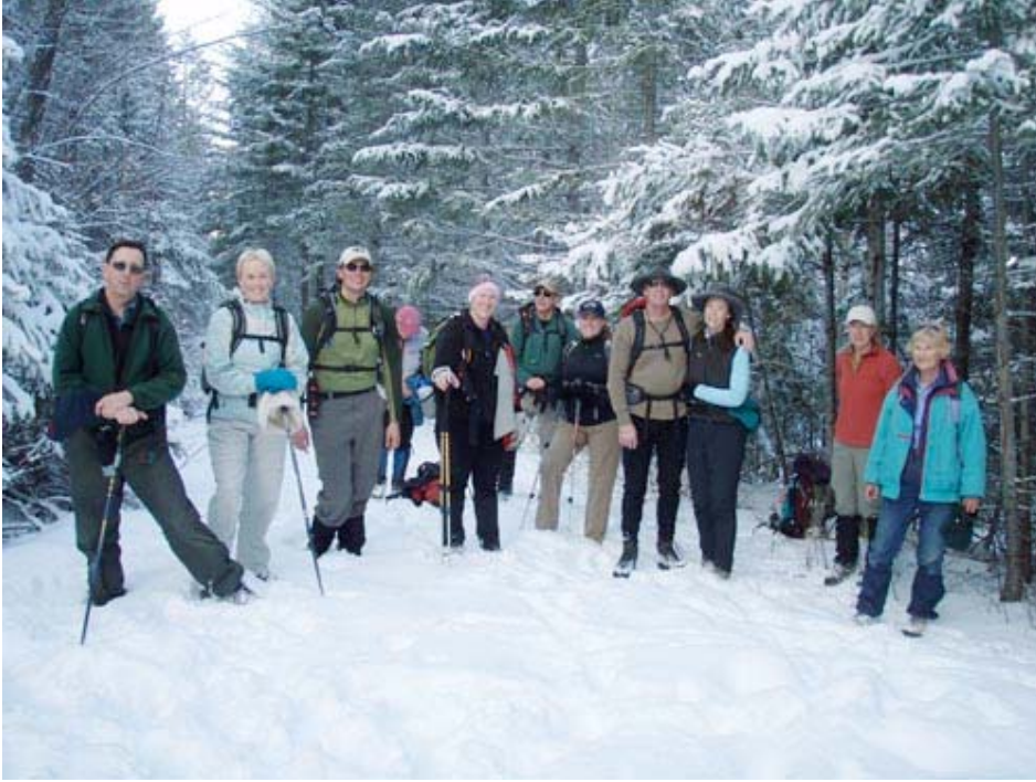
A short pause before heading uphill toward Elk Spring from the old road.