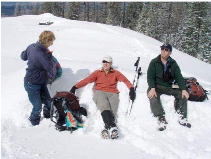
Looks like a good lunch and sunning spot. Get the drift?