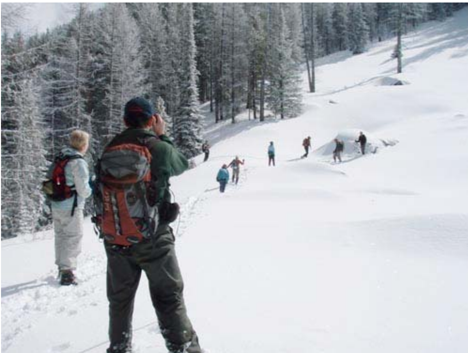
Day's reward: a nice sunny spot for lunch!