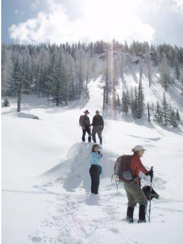
A smoothly sculpted winter scene that is a boulder-strewn scree slope in summer.