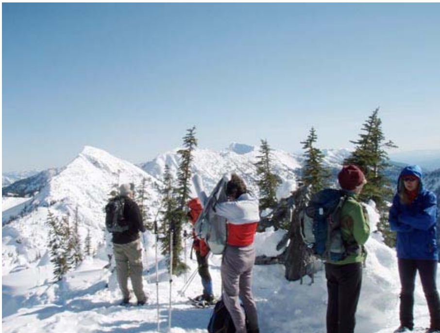
Sunny, but a cool breeze at 7,000' atop the Swan Crest.