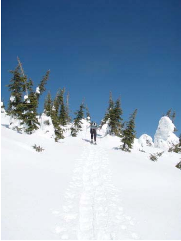
Looks like we're running out of mountain!