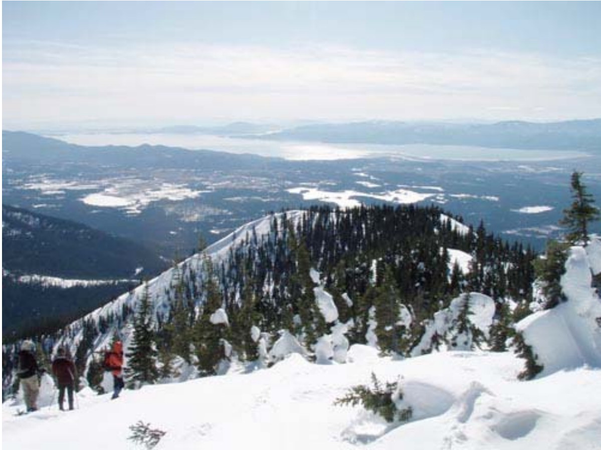
The late afternoon sun lights up Flathead Lake as Rangers head back down Infinity Ridge.