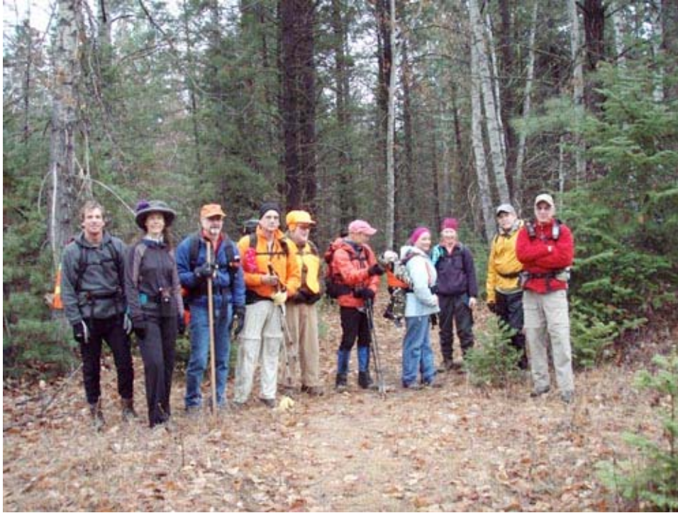
A nice fall day and a nice group of people!