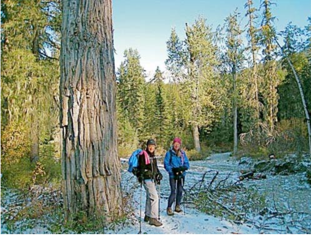
A stop by the "big cottonwood" along Krause Creek.