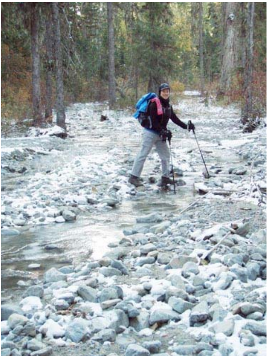
Krause Creek was a little icy but the sky was sunny!