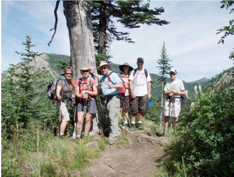
A shady looking bunch of characters well prepared for sun on the divide between Strawberry Lake and Krause Basin.