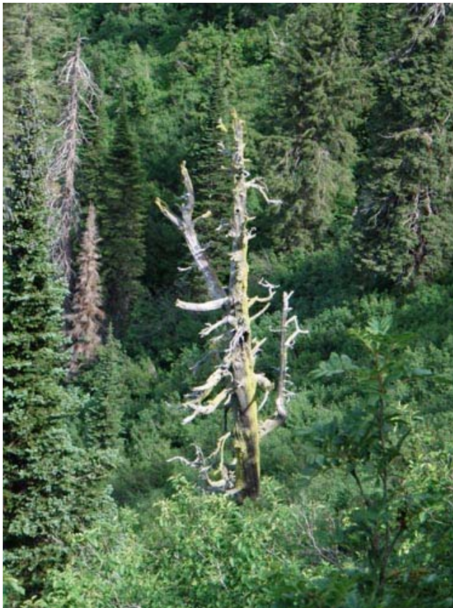
A grand old tree shows off its lichen highlights in the early morning sun.