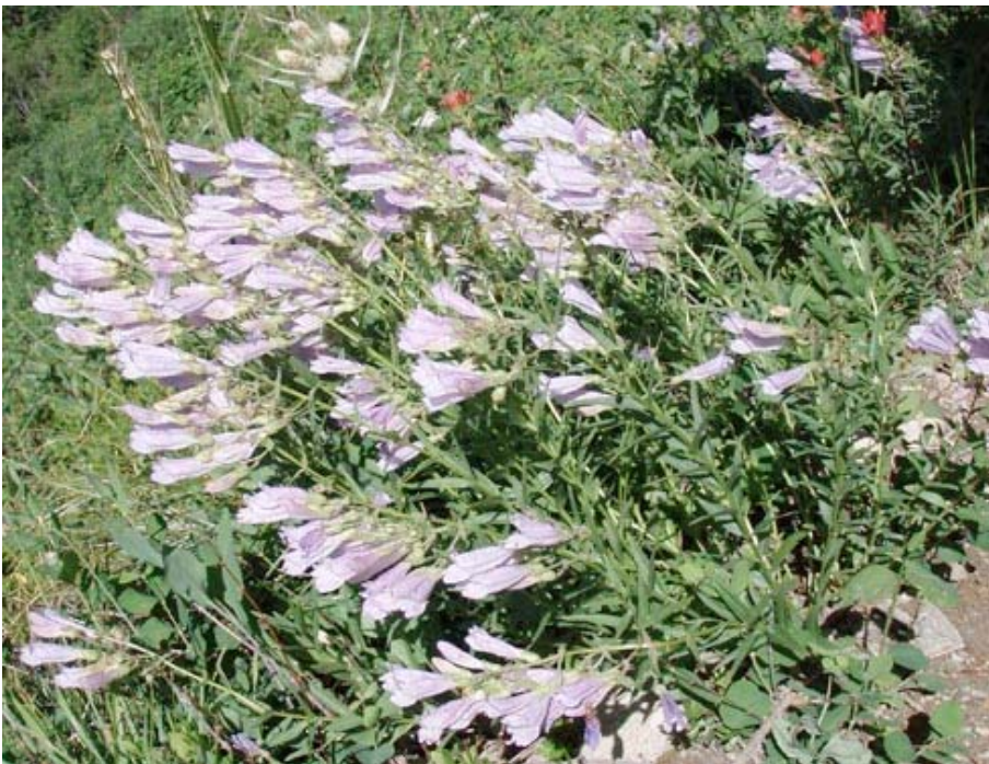
. . . beardtongue (a penstemon) saluting the morning sun . . .