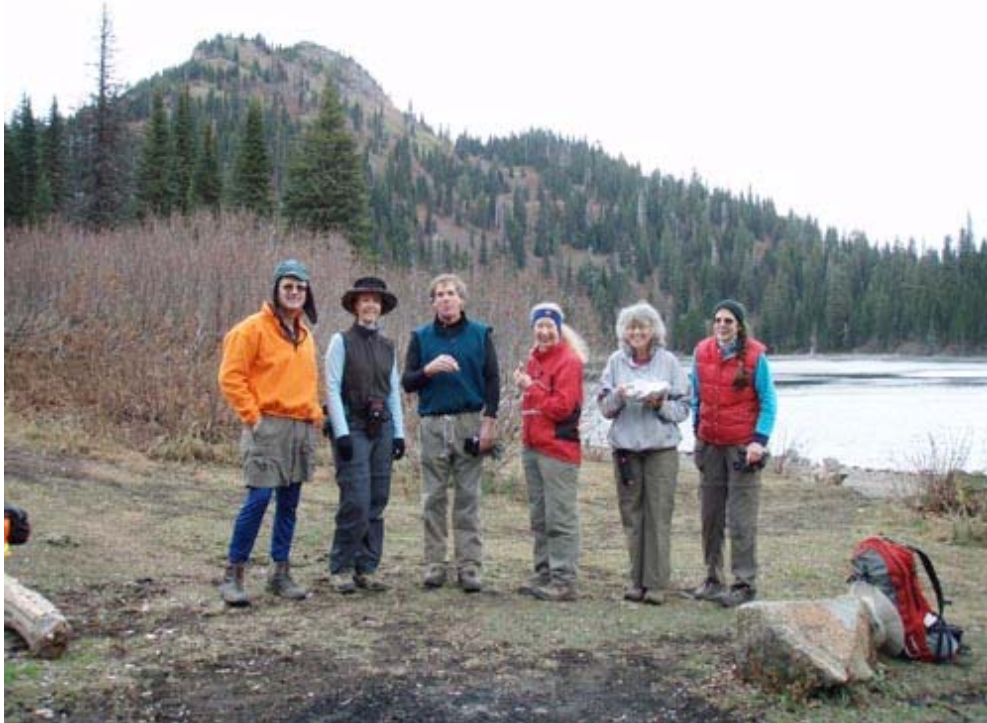
A snack at Strawberry Lake before continuing to the top of the Swan Crest.