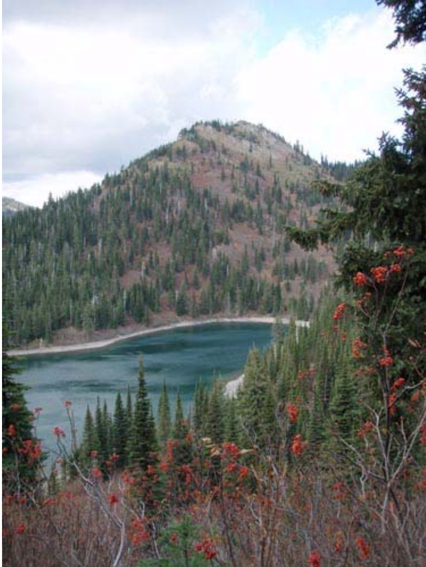
And the return provides novel views of Strawberry Lake, here framed by Mountain Ash berries.