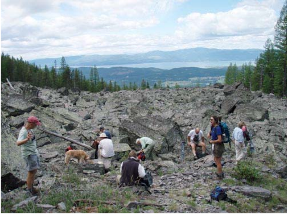
Nice lunch spot!