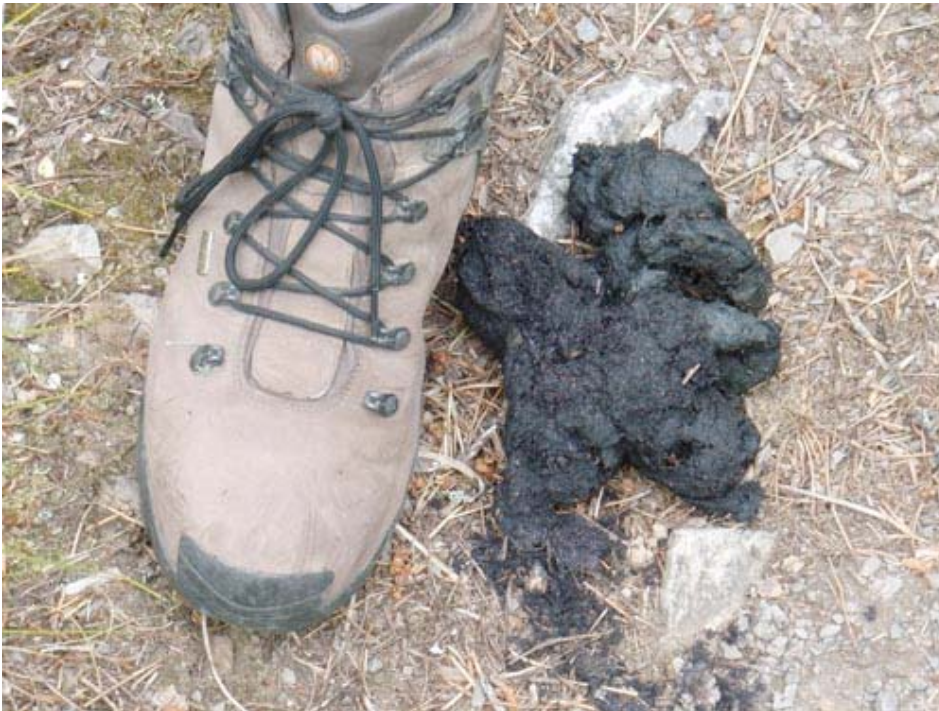
Speaking of lunch, does a bear eat huckleberries in the woods?